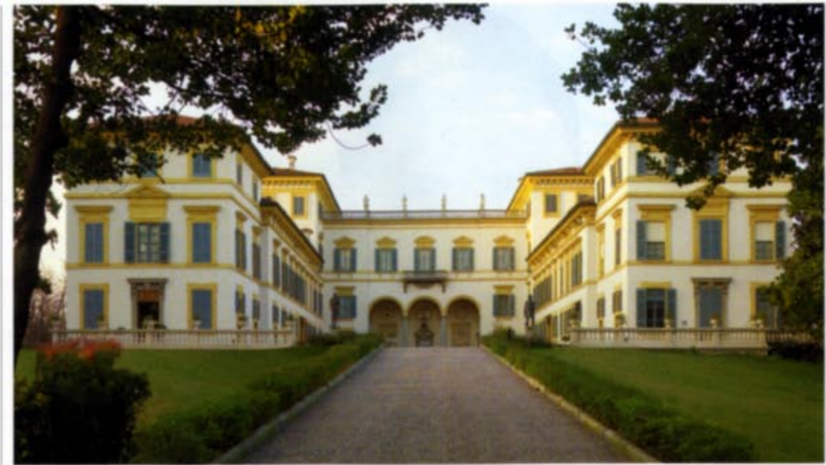
Italy's Villa San Carlo Borromeo, now housing a hotel, has been restored. See page 192.